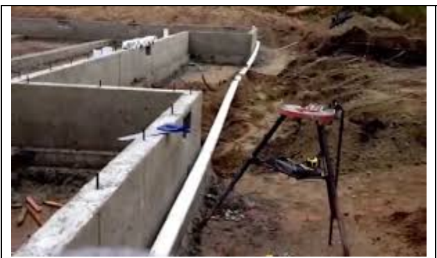
Figure 2 Beginning construction- concrete forms alongside of French under drain pipes.

Summit County considers the underdrains to be a pre-development system auxiliary to the panel concrete forming systems used to initiate work on foundations. These two systems work together, one drains away standing water, the other holds wet concrete until it hardens. The difference is that French drains can be added at almost any stage of construction or remodeling.