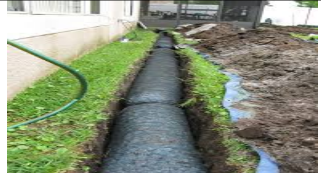
Figure 3 Adding French drains years after construction

Water on your property is a valuable commodity. To learn how the run-off water in and around your crawlspace can be used to water your trees or garden on the perimeter of your yard see this and other Videos.